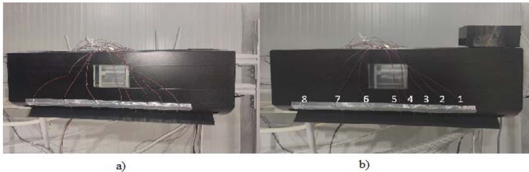
Figure 3. Comparative PTC laboratory tests a) without fresh air module b) with fresh air module

The fresh air intake module, in which the final state of the design was determined with the test results taken from the fan trial setup, was tested in terms of performance, efficiency and heat transfer in the Psychrometric Test Chamber (PTC) laboratory. The fresh air intake module is integrated into the split air conditioner. Tests were carried out with and without modules on it, and the results were evaluated comparatively. Thermocouples were placed at the air outlet section of the split air conditioner at regular intervals, and the temperature differences due to the fresh air supplied to the split air conditioner were examined.