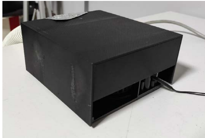
Figure 1. Fresh air intake module

A fresh air intake module, which will work integrated with the split air conditioner, has been designed to provide the fresh air requirement of an indoor environment climatized with a split air conditioner unit. The prototype of this designed module was made and shown in Figure 1.