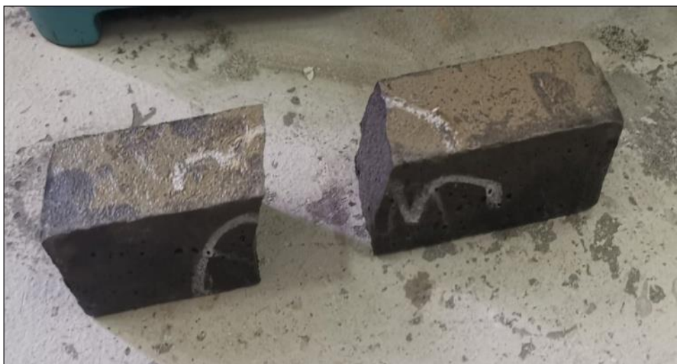
Figure 3. Failure of an ordinary mortar subjected to tension by bending.