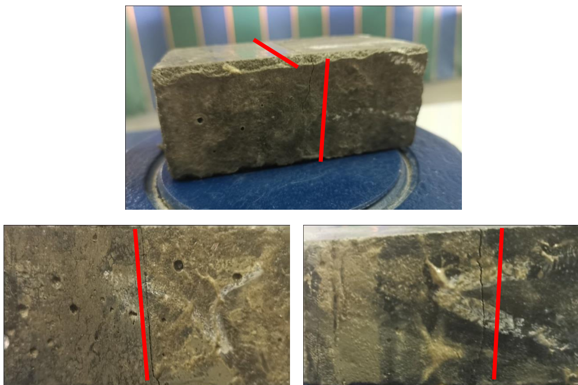
Figure 4. Failure of a mortar reinforced with steel fibers subjected to tension by bending.