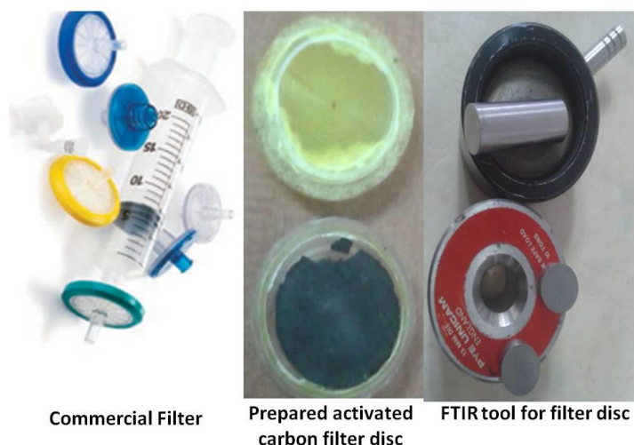
Figure 2. Activated carbon Filter Disc prepared in this study

Measuring of adsorption [Rauof et al., 2015; Gundogdu, et al., 2013]: