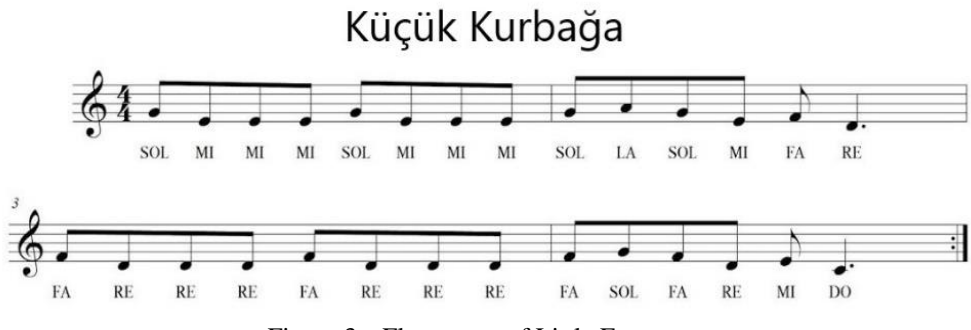
Figure 3.a Flute notes of Little Frog song

The second song are the "Little Frog " song , which the children will enjoy while playing and are familiar with the melody of their ears (Figure 3 a ) . Its tempo is at normal tempo compared to the first song . The marker used to play the Little Frog song is shown in Figure 3.b.