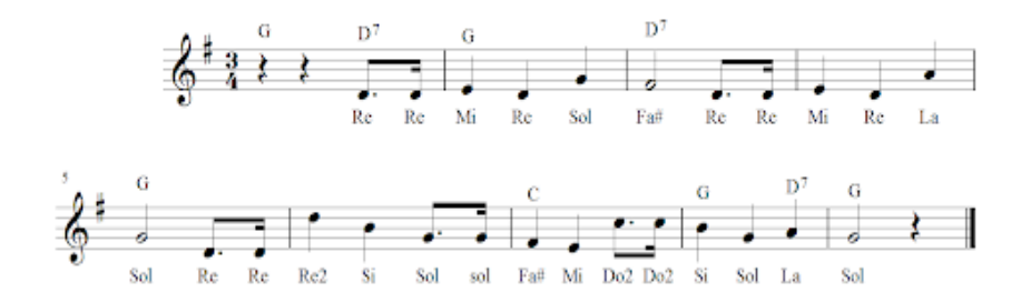
Figure 2.a Flute notes of Happy Birthday To You song.