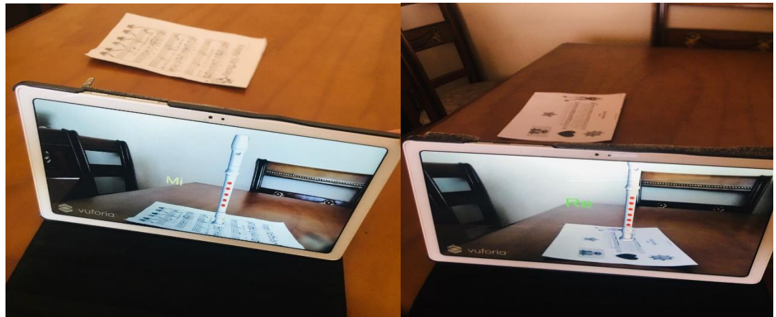
Figure 4.a Happy Birthday to You Song

Ar-Flute application can be installed on any device with an android operating system and a camera. After Ar-Flute is loaded, it is opened by double-clicking on it and the device is held on the specially printed card with the note. When the camera notices the note on the card, the 3D Flute appears and starts playing the notes of the song written on the card it is on. While playing, the light comes on in the holes that should be on the fingers according to the notes, and by the student blowing the flute and moving his fingers on the flute according to these lights, Ar-Flute is experienced in the accompaniment of the 3D flute in practice [Figures 4.a and 4.b].