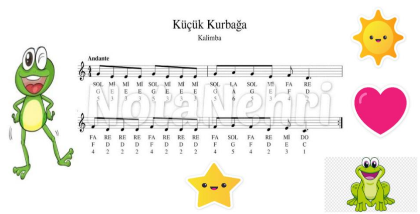
Figure 3.b Necessary marker for Little Frog song to play in Ar-Flute application.

Ar-Flute application can be installed on any device with an android operating system and a camera. After Ar-Flute is loaded, it is opened by double-clicking on it and the device is held on the specially printed card with the note. When the camera notices the note on the card, the 3D Flute appears and starts playing the notes of the song written on the card it is on. While playing, the light comes on in the holes that should be on the fingers according to the notes, and by the student blowing the flute and moving his fingers on the flute according to these lights, Ar-Flute is experienced in the accompaniment of the 3D flute in practice [Figures 4.a and 4.b].