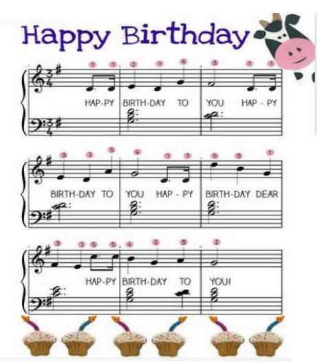
Figure 2.b Necessary pointer to play Happy Birthday To You song in Ar-Flute app.

The second song are the "Little Frog " song , which the children will enjoy while playing and are familiar with the melody of their ears (Figure 3 a ) . Its tempo is at normal tempo compared to the first song . The marker used to play the Little Frog song is shown in Figure 3.b.