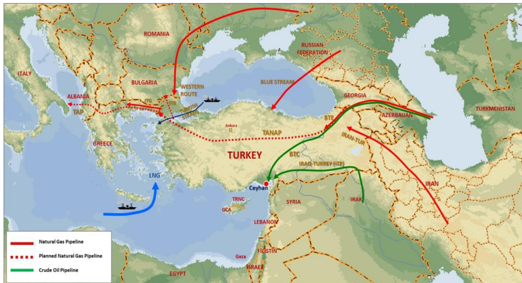
Figure 2. Oil and natural gas pipelines

Turkey is a transit country in a region close to rich reserves, as seen in Figure 2. Turkey's position eliminates its dependence on a single country or a single region in terms of energy supply and makes it advantageous in terms of energy security compared to other dependent countries.